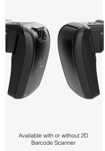
Available with or without 2D Barcode Scanner