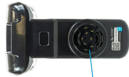
Integrated ePop-Loq® socket