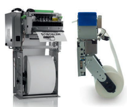
Star TUP & Sanei Range