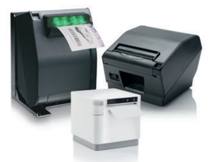
Star TSP700II, TSP800II & mC-Print