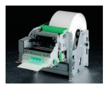
TUP500 Programmable LED Flashing Paper Exit Guide