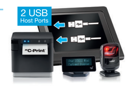
Star mC-Print3, TSP143III, TSP654II Series including Apple AirPrint™ & Sanei Range

Ideal for applications where a lower cost tablet is used for its compact size/slim profile, ease of use and connected services on sites where staff are present to replenish print media. Star's mC-Print3 and HI X Printer Series simplify the kiosk design providing a hub with 2 USB host ports for SCD222 customer display and a range of different scanners as well as remote communication.