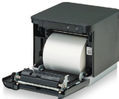
Front Paper Loading