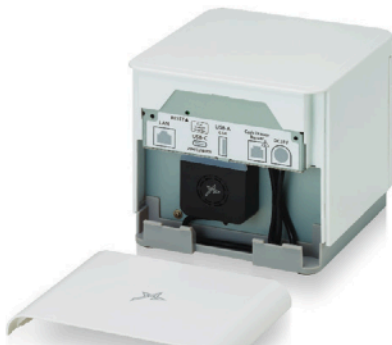
Optional mC-Sound Buzzer