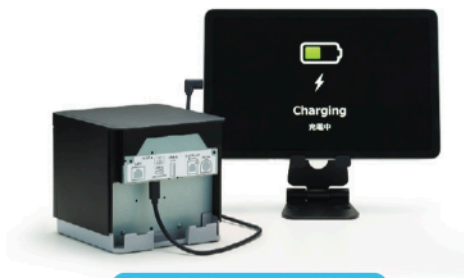
Sync & Charge with USB-C