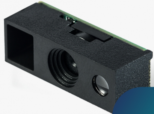
N1 OEM Scan Engines