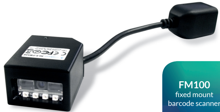
FM100 fixed mount barcode scanner