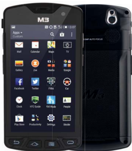
Android 4.3 Jelly Bean