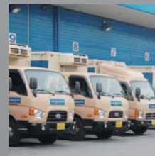
<Food & Beverage>