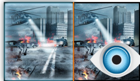
Flicker-free + Blue light

VA panel technology offers higher contrast, darker blacks and much better viewing angles than standard TN technology. The screen will look good no matter what angle you look at it.