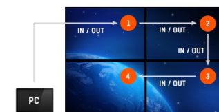
Daisy Chain Support

Thanks to Android OS, you can easily customize the display to your needs by installing applications directly to it.