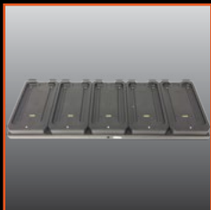
SnapBack Battery Charger