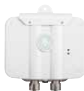
AP 6562E Outdoor 802.11n Up to 600 Mbps 2x2 MIMO