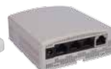
AP 7502E Wallplate 802.11ac Up to 867 Mbps 2X2 MIMO