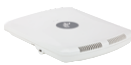
AP 6522E Indoor 802.11n Up to 600 Mbps 2X2 MIMO