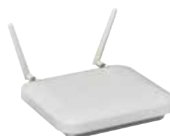
AP 7522E Indoor 802.11ac Up to 867 Mbps 2X2 MIMO