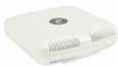
AP 6521E Indoor 802.11n Up to 300 Mbps 2X2 MIMO