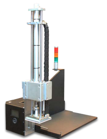
Easy installation, plug & play accessory for the B-EX4 printers series

The piston remains in the up position even if the air is closed.