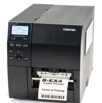
B-EX4 a superior range of industrial printers at midrange price for a wide variety of applications