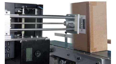
Versatile, applying labels top, bottom or sides at any rotation

Toshiba technology enables real world and dramatic reductions in operating costs. The APLEX4 module works in conjunction with the B-EX4 printers series, with options like the automatic ribbon saving and improved technologies that reduces by almost 70% the energy consumption in standby mode when compared to its predecessor. The dual motor ribbon drive removes wrinkles in the ribbon and so reduces paper and ribbon waste. These special features reduce the total operating costs while helping to preserve the environment.