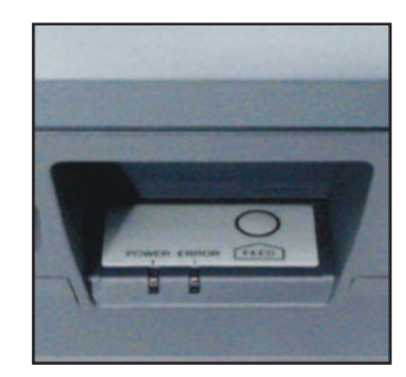
Disabled Paper Feed Button