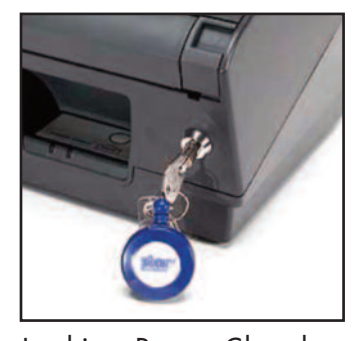
Locking Paper Chamber