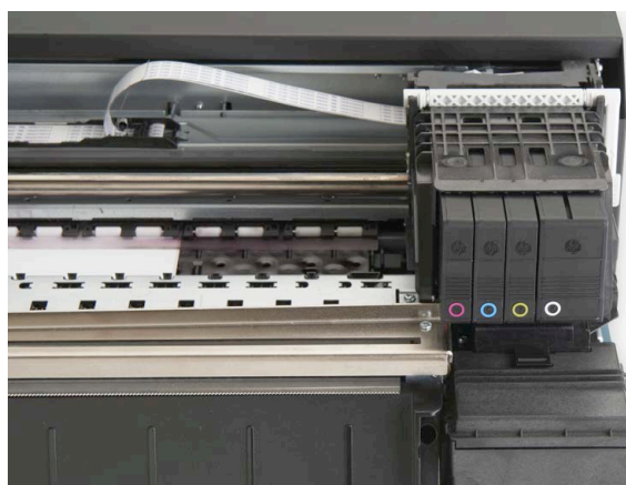
Separate ink tanks on LX2000e Color Label Printer

LX2000e is the best choice for printing from just a few to many thousands of labels at a time. It has the lowest cost per label of any of Primera's inkjet-based label printers.