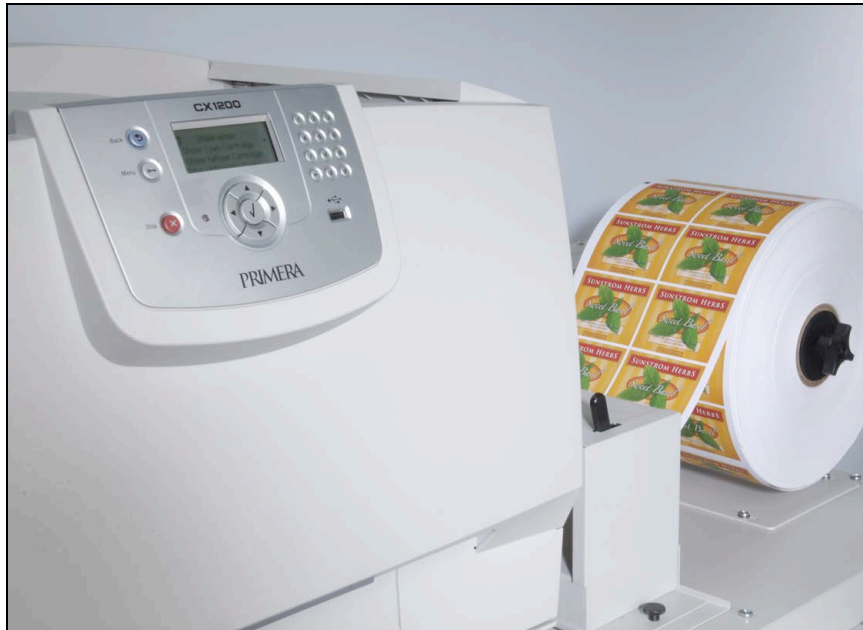
Produce up to 12" (305mm) diameter rolls of digital labels on CX1200e

Two digital technologies stand out and are clearly superior for producing the highest-quality, lowest cost output in short- to medium-sized runs: inkjet and laser-based color label printing. Primera has both technologies available now with its LX-Series Color Label Printers and CX1200e Digital Label Press with FX1200e Digital Label Finishing System.