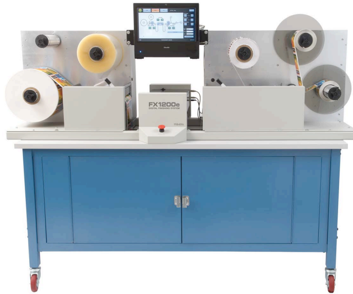
FX1200e Digital Label Finishing System (Shown with optional lined lamination mandrel)

Together, CX1200e and FX1200e gives any company the ability to produce their own high-quality, low-cost labels at speeds that satisfy almost any short-to-medium label run requirements.