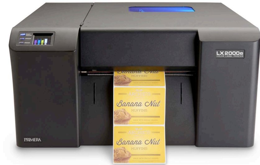
LX2000e Color Label Printer