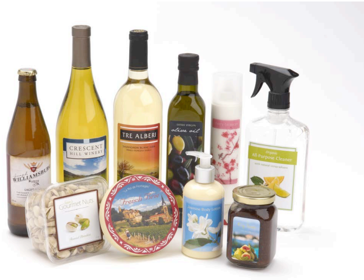
Some of the products that can benefit from digital label production

Putting the most professional color labels possible on your products will set them apart from others. This is especially important for smaller manufacturers who can actually increase their sales by making their products stand out through innovative packaging and labeling. It also allows manufacturers of all sizes to offer private label goods in smaller quantities.