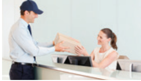
Transportation & Logistics