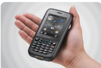
The Smallest, The Lightest