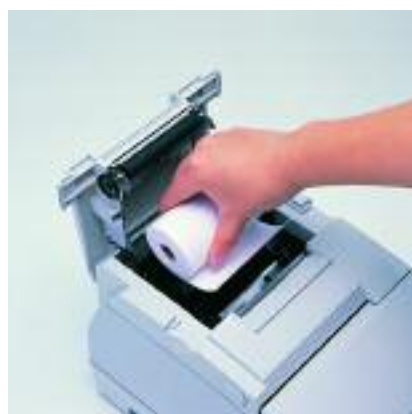
Easy drop-in paper load