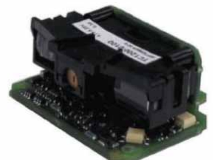
TC1200 SCAN ENGINE MODEL