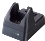
Charging and communication cradle