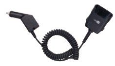
Snap-on car charger