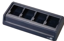
4-slot battery charger