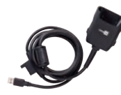
Snap-on cable (USB / RS232)