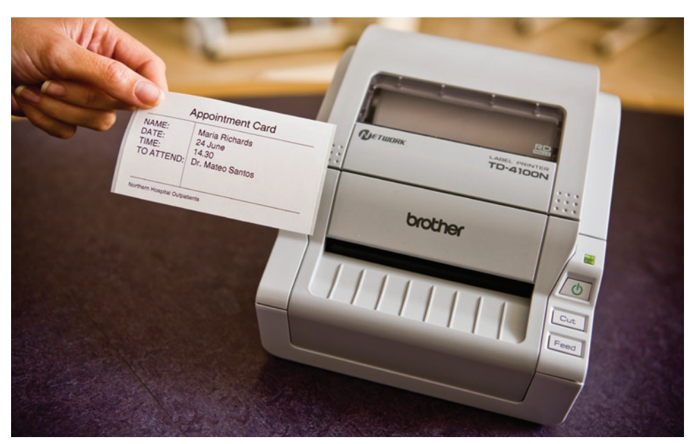
By connecting the TD-4100N to a nearby network point, the machine can be sited wherever the labels are required

The professional and reliable method of connecting label printers is typically via a network, and the TD-4100N incorporates a 10/100 Base TX network port as standard. By giving the opportunity to locate the label printer away from the PC, you have the advantage of being able to place the label printer wherever your labels are required. And of course, networking offers the ability for any number of users or computers to print their labels to the same label printer. If many copies of labels are required quickly, the "distributed printing" function (found in the printer driver) will automatically send the print job to two or more connected printers - thereby increasing throughput. As an example, if two TD-4100N label printers are set up for distributed printing and 10 copies of a label are required, the driver will automatically send five labels to one printer, and five labels to another.