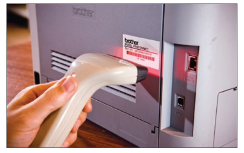
Connect a barcode scanner to the printer's serial port to print labels directly from the TD-4000/TD-4100N*