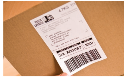
Barcodes, company logos and other information is easily printed up to 4 inch/102 mm wide