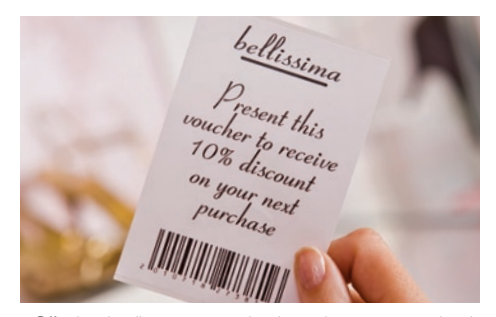
Offer loyalty discounts, or other incentives, to your valued customers with specially printed vouchers