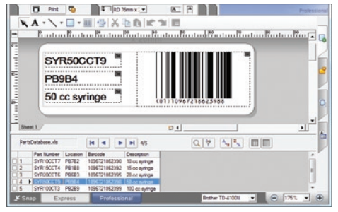
By linking to a Microsoft® Excel™ file, merge the data and print labels directly from P-touch Editor 5