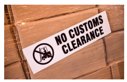
The continuous roll offers the ability to create temporary signage on demand