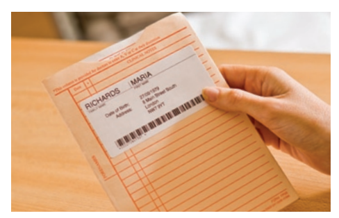
Locate patients' records and other important documentation quickly with an identification label