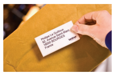
Address labels can be created quickly and easily - you can even incorporate logos or other graphics

With the most common sizes of shipping labels available for the TD-4000 and TD-4100N, and the ability to create custom sized labels using the built-in cutter, there are many uses for these models in the warehouse. Brother RD label rolls are made of high quality materials, ensuring the printed text and barcodes stay readable on the label while items are being shipped.