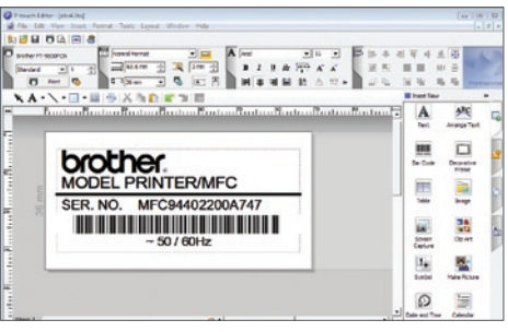
P-touch Editor 5 gives you the creative options to design and print any label required

Connect to non-windows devices using the RS-232 serial port. By sending simple text commands containing the label format and the text/barcode to be printed, the labelling machine will print the label required. No driver or software needs installing.