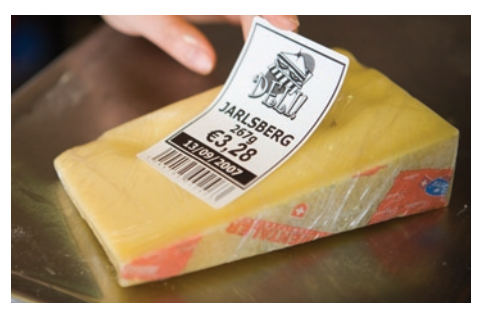
The adhesive used in the Brother RD rolls has been certified safe for food labelling